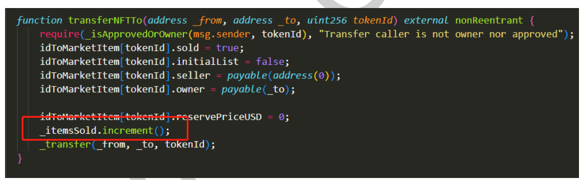
Figure 2 transferNFTTo function

As shown in Figure 2 below, when the user owns the NFT or has the authorization of the specified tokenId, users can call transferNFTTo function to transfer NFT. The value of _itemsSold is incremented by 1 each time it is called , In fact, the NFT under the contract is not sold. As shown in Figure 3 below , When calling the fetchMarketItems function to query the unsold NFTs under the contract, it may cause an overflow, causing the function call to fail.