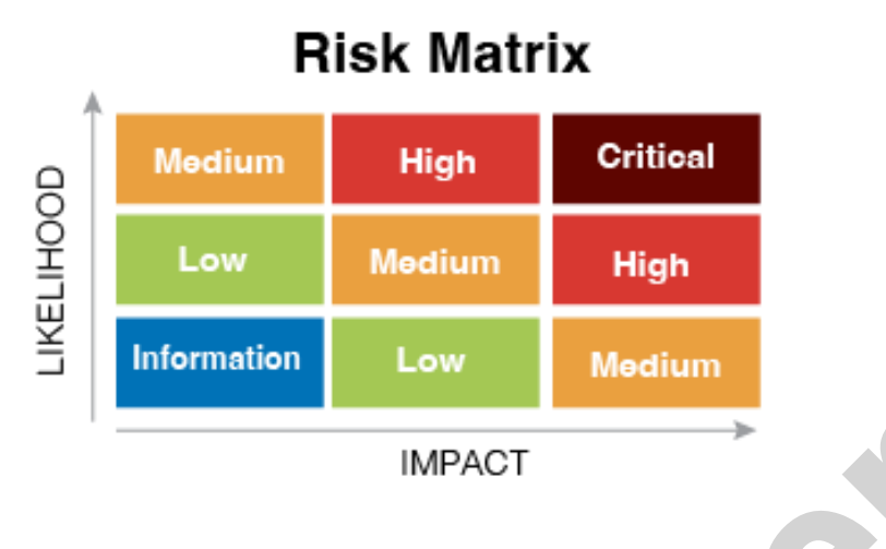
Table 1.1: Overall Risk Severity

To evaluate the risk, we will be going through a list of items, and each would be labelled with a severity category. The audit was performed with a systematic approach guided by a comprehensive assessment list carefully designed to identify known and impactful security issues. If our tool or analysis does not identify any issue, the contract can be considered safe regarding the assessed item. For any discovered issue, we might further deploy contracts on our private test environment and run tests to confirm the findings. If necessary, we would additionally build a PoC to demonstrate the possibility of exploitation. The concrete list of check items is shown in Table 1.2.